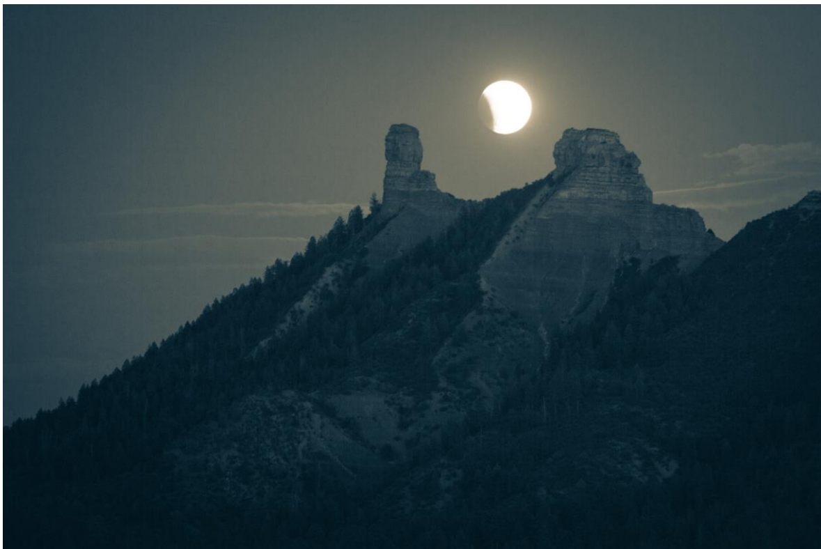
(Viewed from nearby Peterson Ridge).